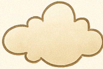
Cloud like an animal