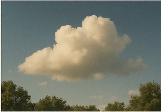
cloud like an animal