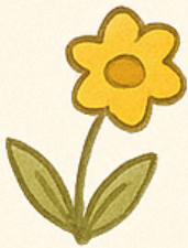
something yellow in nature